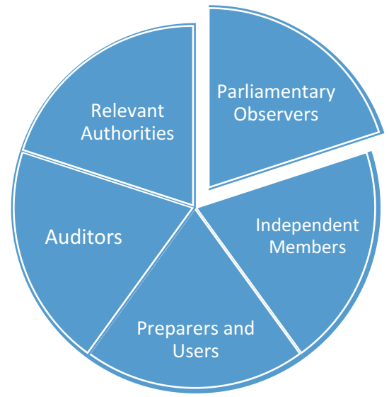
The pie chart above details the breakdown of FRAB membership into core groups.

Consisting of three members nominated by finance directors of UK government departments, one member nominated by the national statistician, one member nominated by the Ministry of Housing Communities and Local Government and one member nominated by CIPFA/LASAAC¹ from their own membership.